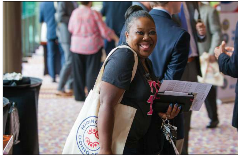
A participant at one of GCO's Hiring Well, Doing Good events.

GCO also developed relationships with business leaders across the state, and specifically in the Columbus area. These businesses had a manpower shortage and were desperate to find talent to fill available jobs. GCO's conversations with these groups sparked their idea for the Hiring Well, Doing Good program. The initiative brings together nonprofits and business leaders with the shared goal of getting people into the job market. GCO connects low-income individuals with nonprofits