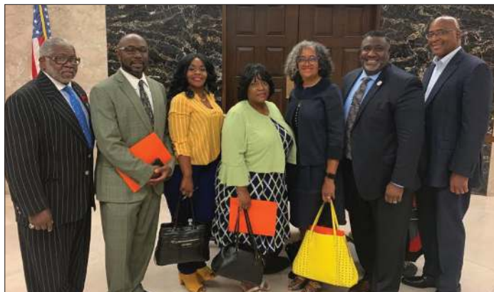
Members of the Parent Union with a local NAACP chapter. The Parent Union works with NAACP chapters across the state to give more options and hope to African American students.

The Beacon Center of Tennessee stepped in, befriended local hair braiders, and helped share their story. Tennessee then passed the Hair Braiding Freedom Act, removing burdensome licensing requirements for people who want