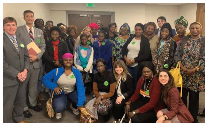
The Beacon Center team and local Tennessee hair braiders.

to braid hair and reducing the number of training hours to just 16. This victory was due in large part to the powerful relationships Beacon Center cultivated with the people who needed the policy change most.