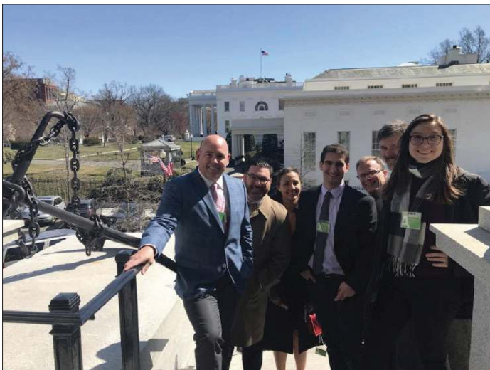
SPN's Healthcare Working Group at the White House.